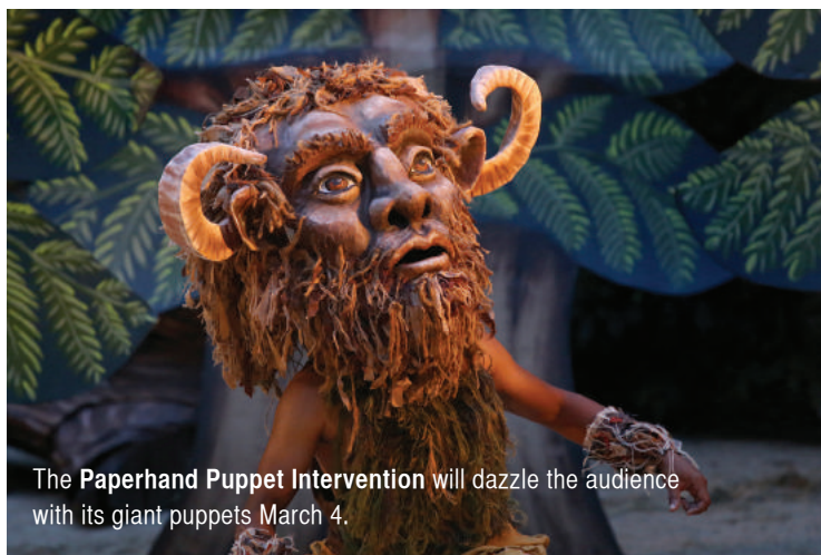
The Paperhand Puppet Intervention will dazzle the audience with its giant puppets March 4.

You'll discover enriching experiences at the centre that will leave you feeling inspired.