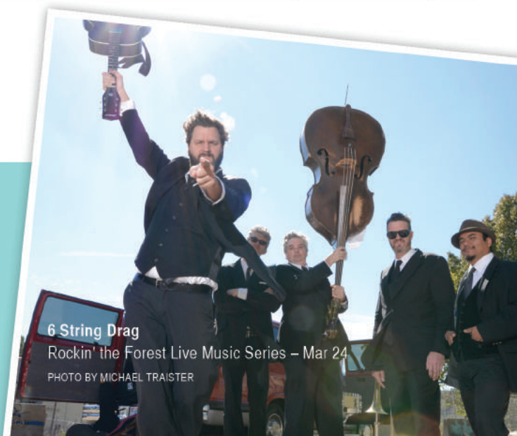
6 String Drag

Sign up to receive email updates about upcoming events at the Renaissance Centre by visiting wakeforestrencen.org and clicking on "Join our Mailing List."