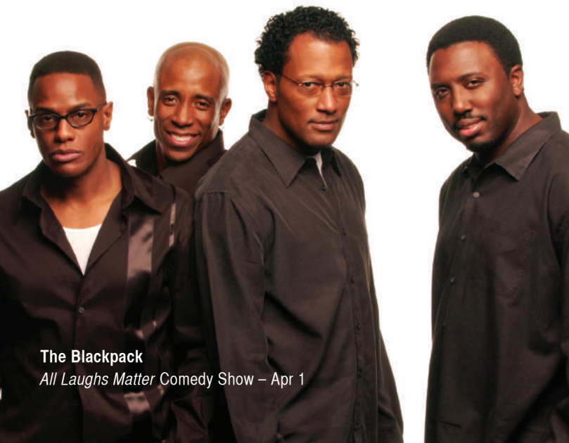
The Backpack All Laughs Matter Comedy Show – Apr 1